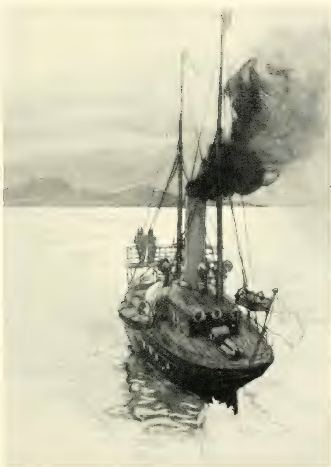
BACK TO NEPALIA.